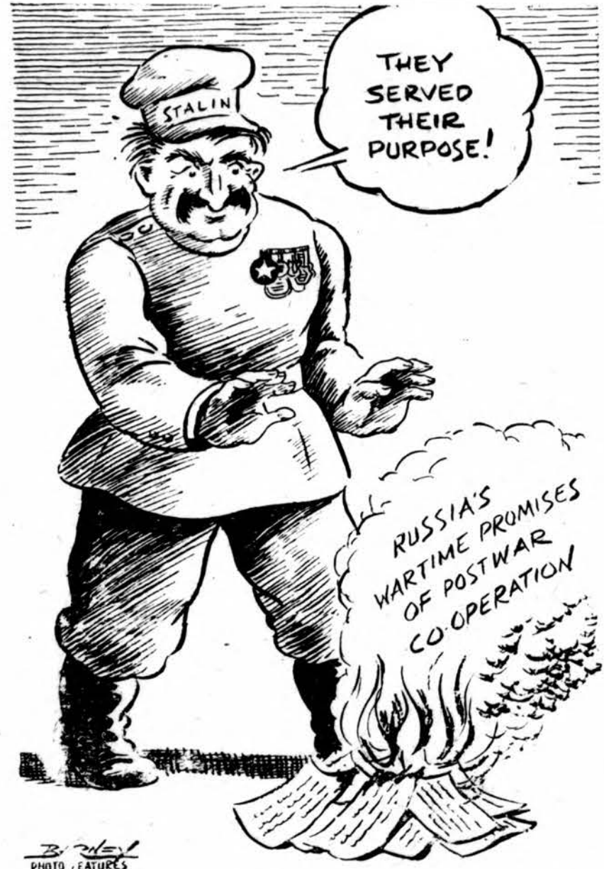
B. RILEY PHOTO FEATURES