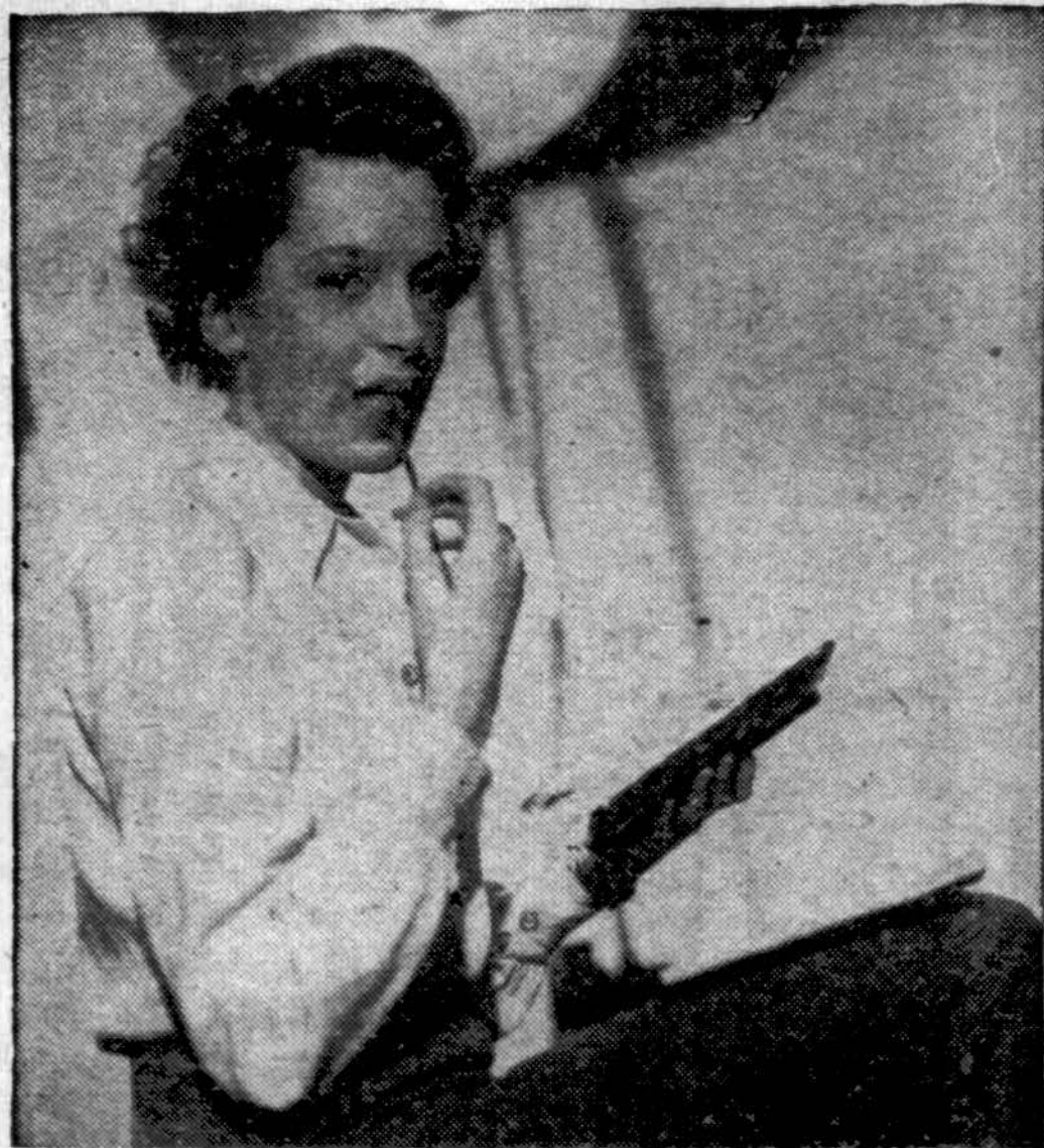
DEBORAH KERR is England's latest and most welcome gift to America, M-G-M and Clark Gable. The lovely Deborah is starring opposite Clark in the studio's forthcoming film, "The Hucksters." Already known for her performances in the English films, "Vacation From Marriage" and "Colonel Blimp," Miss Kerr's beauty and acting ability is destined for further fame.